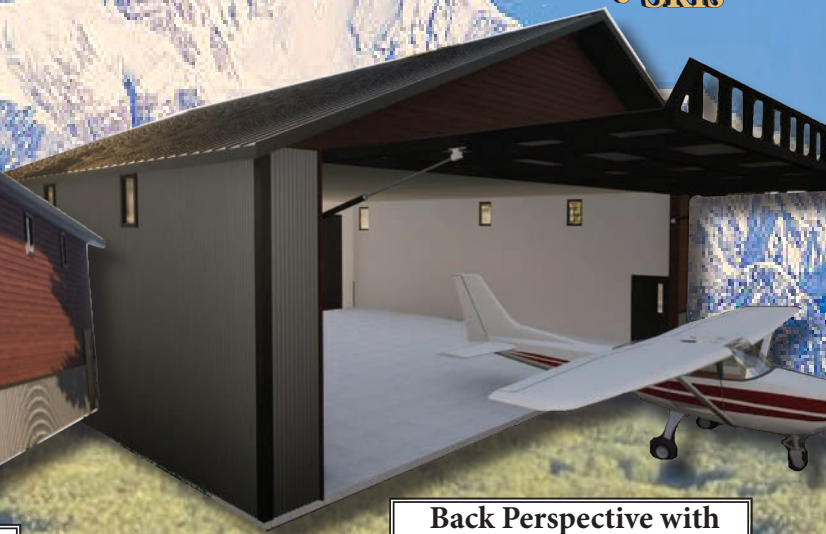
Back Perspective with 16' x 44' Hydrolift Door