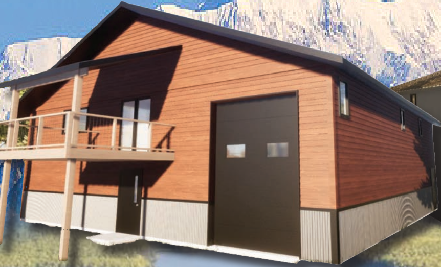
Front Perspective with RV Door Option